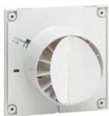
Back draught prevention vanes fitted on discharge